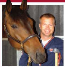
Lee Pearson CBE, triple gold medalist at the last three Paralympic Games