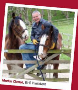
Martin Clunes, BHS President